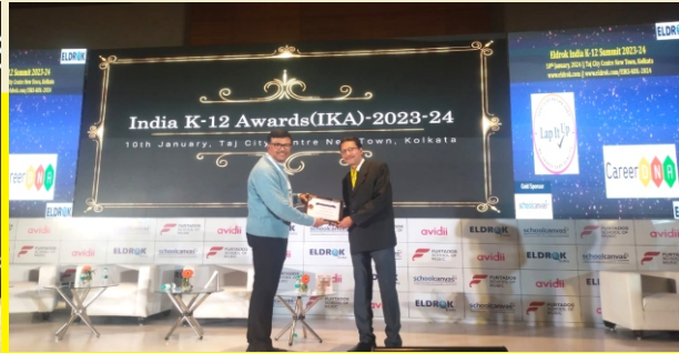
India K-12 Award - 2024 Best upcoming school for Excellence in Adopting & Imparting Hybrid Learning Programs by Eldrok India.