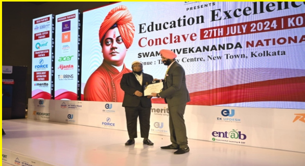
Swami Vivekananda National Award - 2024