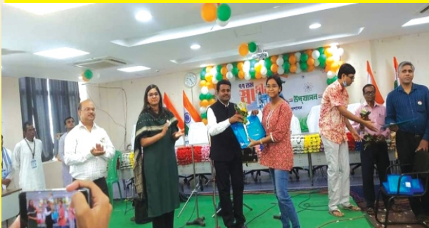
"B.R. Ambedkar Medha Puraskar - 2023"