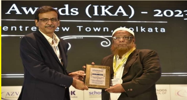
India K-12 Award - 2023 Best upcoming school for Excellence in Adopting & Imparting Hybrid Learning Programs by Eldrok India.