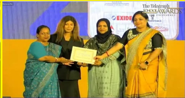
The Telegraph School Awards