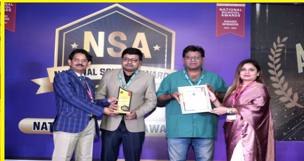
National School Award - 2024